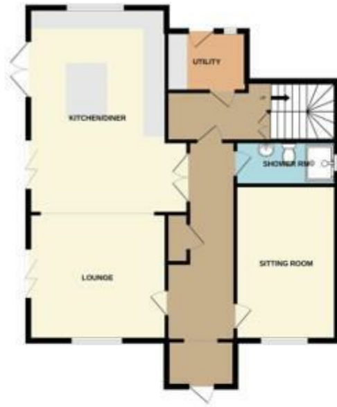
GROUND FLOOR 735 sq.ft. (68.3 sq.m.) approx.